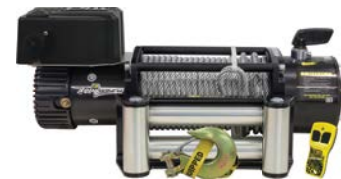
PART NUMBER. 947TJMTQ95SAA