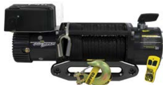
PART NUMBER. 947TQBK12DAA