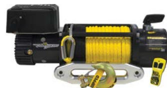
PART NUMBER. 947TJMTQ12DAA