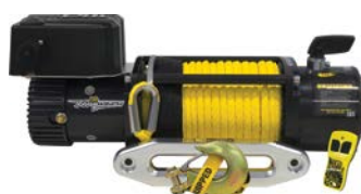
PART NUMBER. 947TJMTQ95DAA