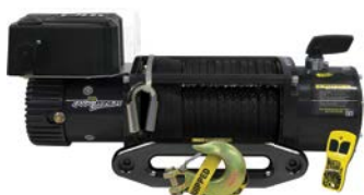
PART NUMBER. 947TQBK95DAA